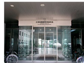
11 Faculty of Information Science and Technology BLDG