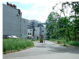
10 North Entrance/School of Engineering