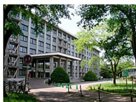
6 Main Entrance/School of Engineering