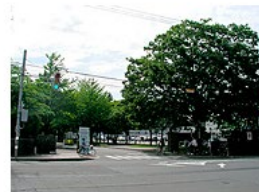
3 Kita 13-jo Gate