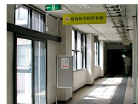
8 Approach in 1st Floor/School of Engineering