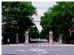
1 Main Gate