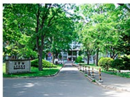
4 Entrance / School of Engineering