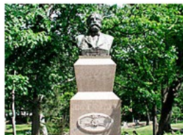
2 Bust of Dr. William S. Clark