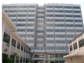
9 Entrance/Faculty of Information Science and Technology BLDG