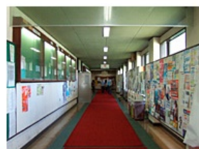
7 Approach in Robby/School of Engineering